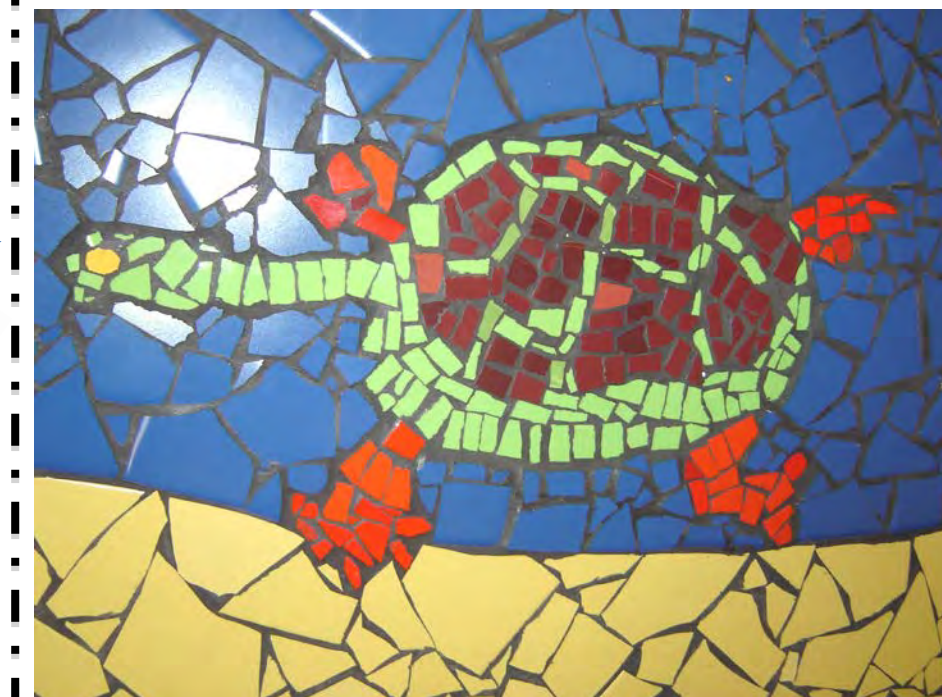
Oblong Turtle Mural at Coolbinia Primary School