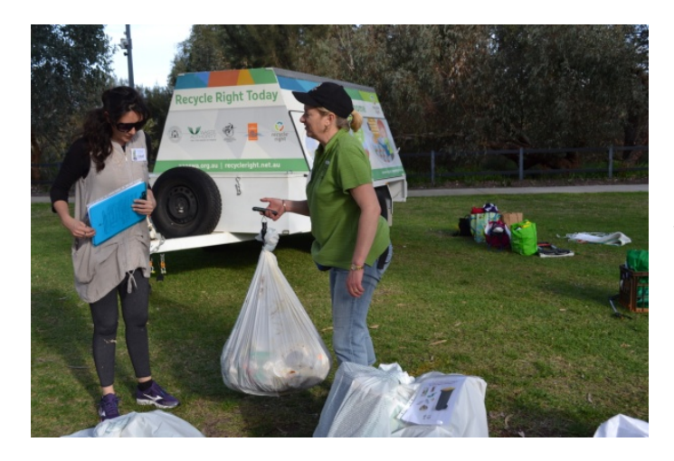
Weighing and auditing labelled bin bags

Over the eight years, while expo attendances increased from 300 (2009) to 3000 (2016), the amount of waste generated per person fell from 0.024kg to 0.007kg, indicating our successes. Results from the waste surveys continue to indicate that people have a positive attitude toward recycling and reducing waste, however a major challenge relates to knowledge about separating their waste correctly.